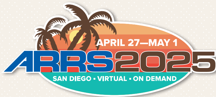
Exhibit Space Application

Complete this application for exhibit space and return to: ARRS, 44211 Slatestone Court, Leesburg, VA, 20176 or fax it to (703) 729-4839 or online at www.arrs.org/Exhibit